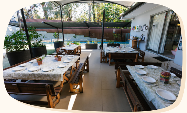
Dining Space (Cenare)