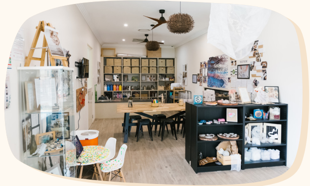
Art Studio (Atelier)